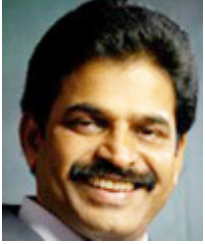
Sh. K.C. Venugopal

Sh. K.C. Venugopal, Hon'ble Member of Parliament from Allappuzha constituency of Kerala was sworn in as Minister of State for Power in Union Cabinet on 19th January, 2011. Elected to Kerala Legislative Assembly three times consecutively (1996, 2001 and 2006) from Alappuzha constituency, 47-year-old Venugopal is known for efficiently implementing projects in Kerala where he served as the minister for Tourism, Devaswom and Culture in 2004-06.