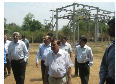
ED(PFC) along with MPPKVCL officials at a sub-station in Sihora town

also visited R-APDRP data center at Jabalpur and also visited Siroha, a town selected as pilot town. The team also visited the Division office, both the Substations in the town and two distribution transformers locations, to observe the progress on hardware installation, GIS & Meter Data Acquisition System (MDAS).