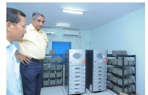
Secretary(Power) & MD, GUVNL at battery room of CCC