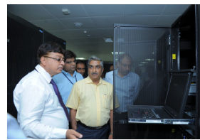
Secretary (Power) & JS evincing keen interest at GUVNL Data Center

software modules as required in the Part-A of R-APDRP. Network connectivity with Pilot town Vyara has also been established. Necessary Bandwidth provisions for connecting to the entire R-APDRP towns in Gujarat have been made in DC.The team from MoP was shown various DC hardware components & racks and were also explained their functionalities. Secretary (Power) evinced keen interest in the same. They also visited Customer Care Center to overview CCC equipments and their functioning. Here, the