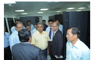
Secretary (Power) & JS discussing about data center with TCS officials